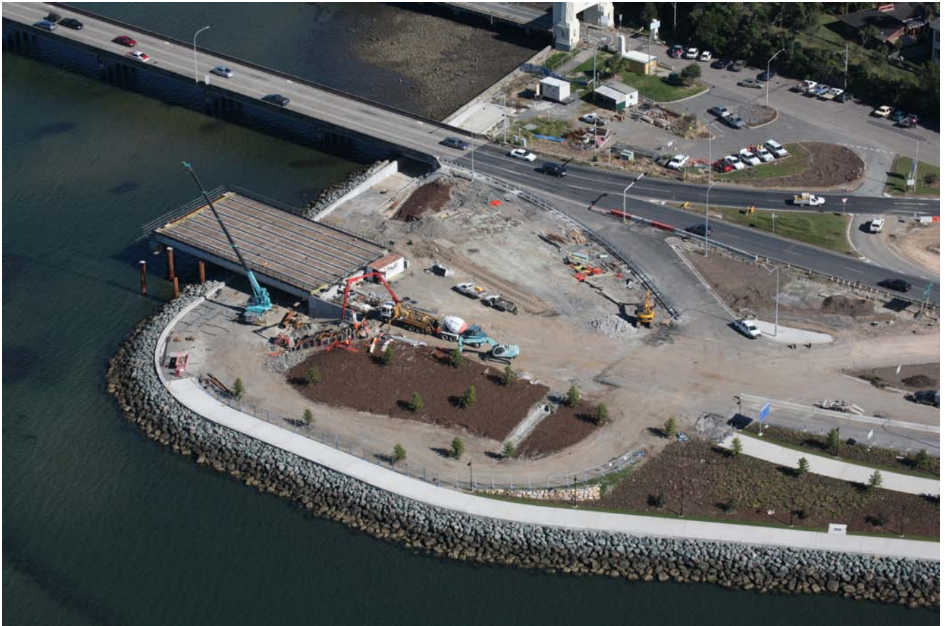
ABOVE: CONSTRUCTION OF THE 78 TH SPAN OF THE NEW TED SMOUT MEMORIAL BRIDGE IN PROGRESS AT CLONTARF POINT.