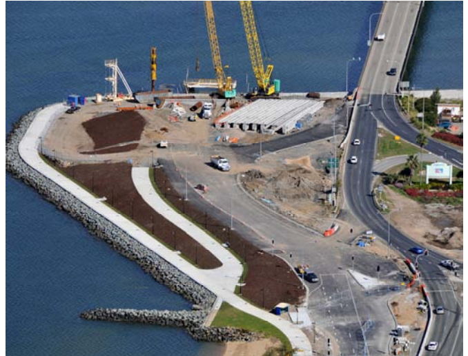
ABOVE: DEVELOPMENT OF THE NORTHERN EMBANKMENT OF THE NEW HOUGHTON HIGHWAY BRIDGE UNDERWAY AT CLONTARF POINT

Access to the old Hornibrook Bridge carpark at Clontarf will be closed to southbound traffic on Elizabeth Avenue and Hornibrook Esplanade from August/September 2009 (weather permitting). The carpark will remain accessible to northbound traffic exiting the Houghton Highway bridge at Clontarf.