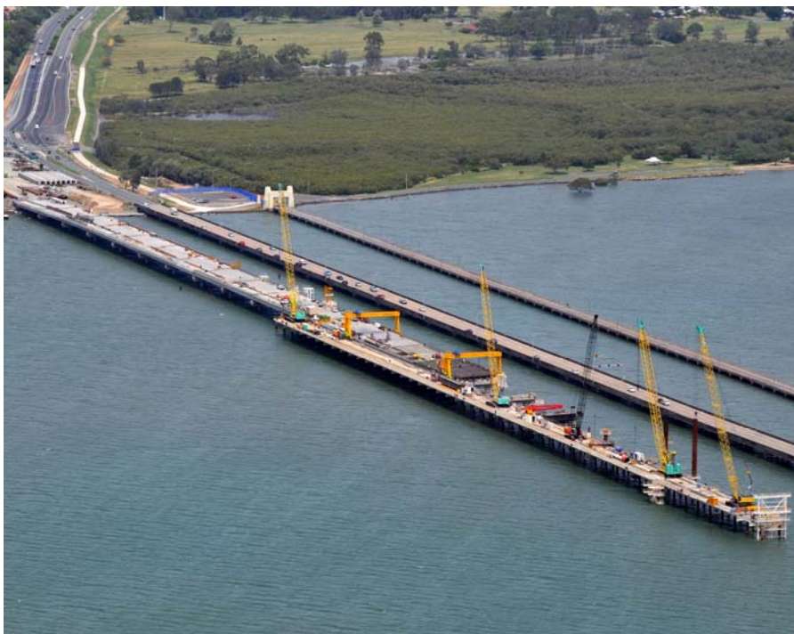
ABOVE: CONSTRUCTION OF THE NEW HOUGHTON HIGHWAY BRIDGE IN PROGRESS OFF THE BRIGHTON FORESHORE. THE ERECTED SPANS OF THE BRIDGE ON THE LEFT OF THE PICTURE ARE BEING FITTED WITH CONCRETE BARRIERS, WHILE CONSTRUCTION OF NEW SPANS CONTINUES TO THE RIGHT OF THE FRAME.