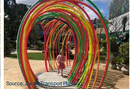
Art installations West End