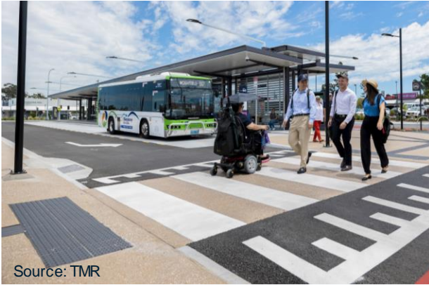
Raised platform crossing with TGSI