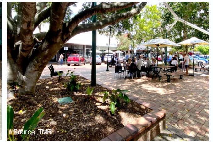
Shaded rest stops with Public Toilets