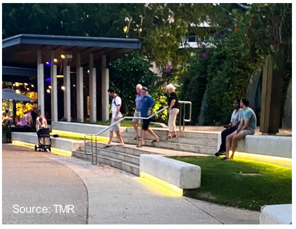
Handrail and stairs landings