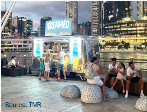
Food van activation South Bank