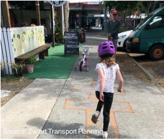
Playful pavement West End