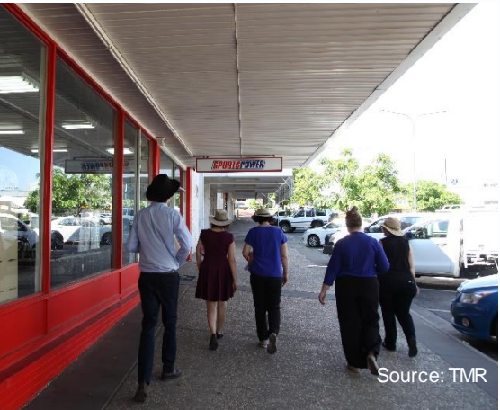
Integrated shelter Mount Isa