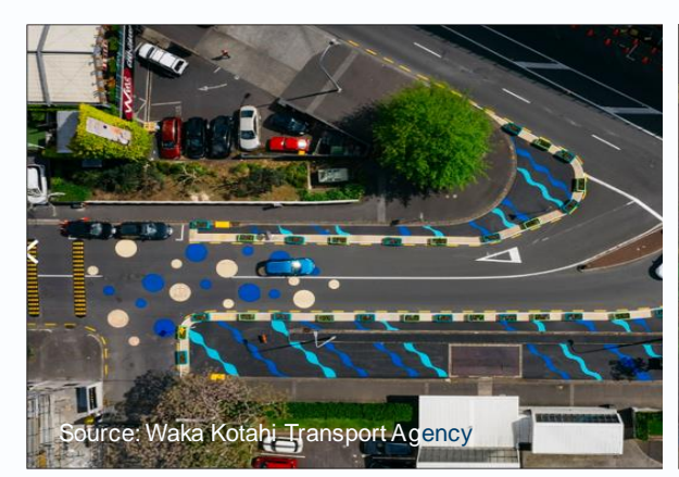
Trial kerb buildouts to reduce road space Auckland, NZ

Active areas to make human-scale and inviting places where people want to walk. Use low-cost, temporary changes to test ideas and engage with communities.