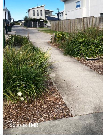
Filtered permeability Beenleigh