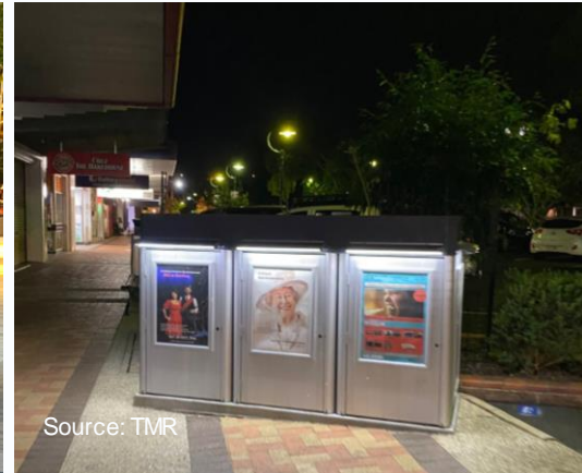
Lighting Cairns CBD