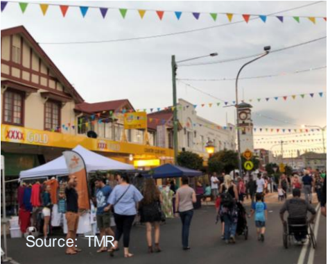
Markets / fetes Stanthorpe