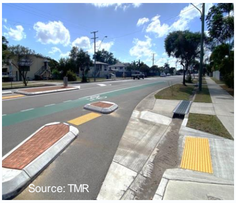
Reallocated space Currajong