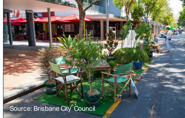
Reimagining parking space South Bank