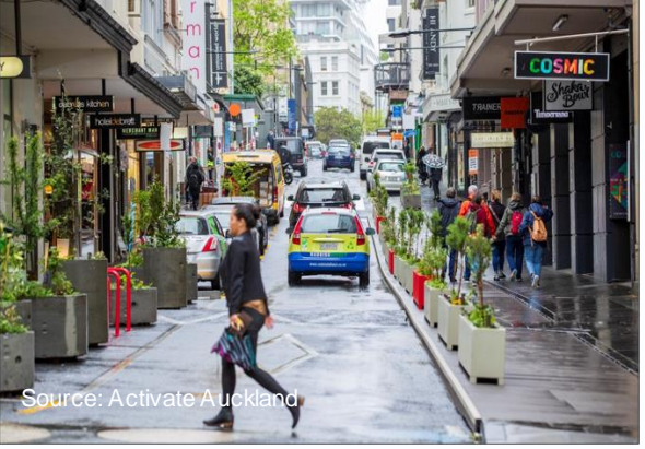
Temporary footpath widening Auckland, NZ