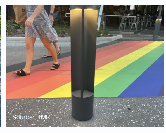
Engaging footpath art