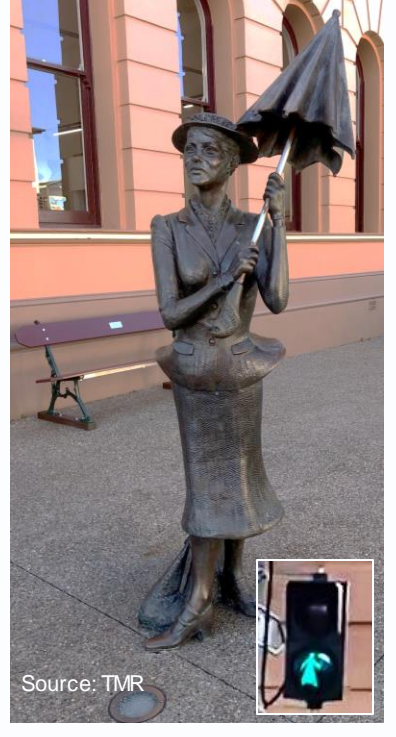
Storytelling art Maryborough