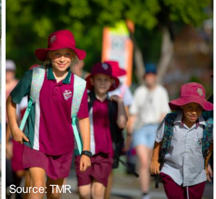
Wide path near schools Aspley