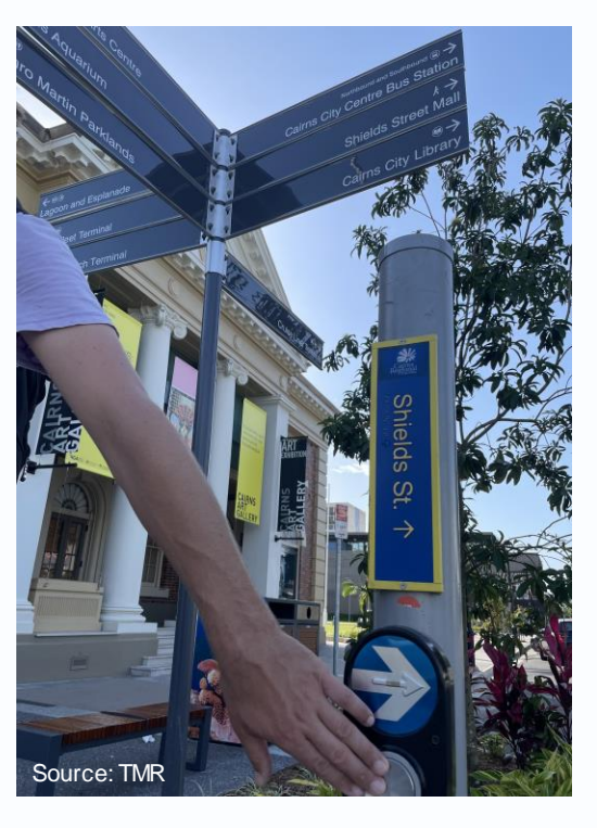
Braille signage and audible crossing