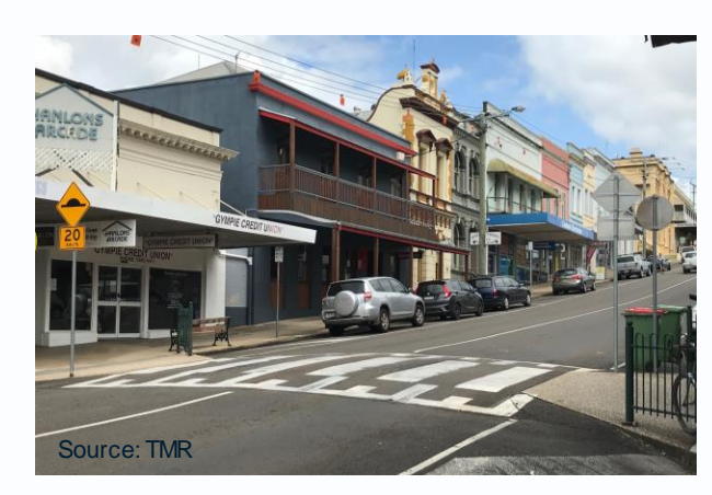
Accessible crossing Gympie

Provide accessible crossings and supporting infrastructure to improve access for all ages, abilities and trip types.