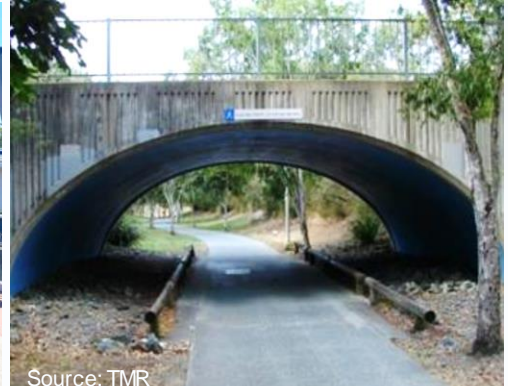
Wide CPTED underpass Grange