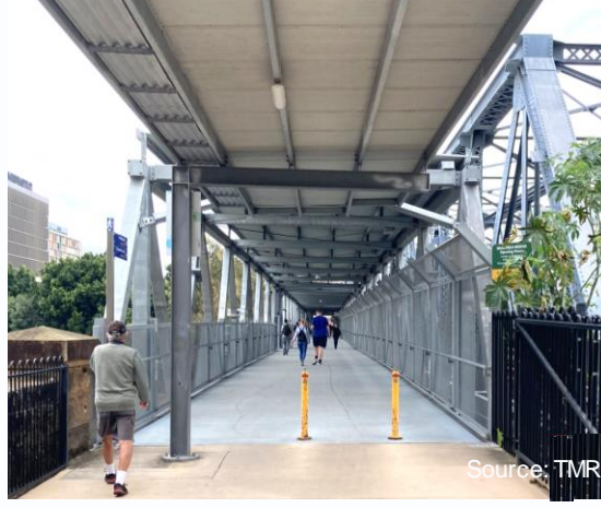
Sheltered bridge lpswich