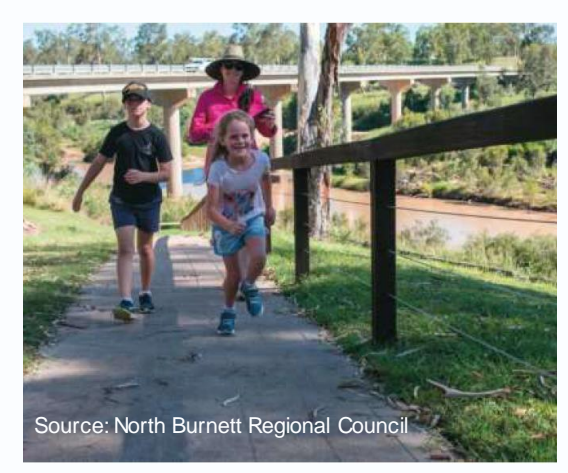
Shade and handrail Mundubbera

Create accessible and inclusive transport network that is welcoming and encouraging to all ages and abilities to travel by active modes. Design walking environments that encourage and facilitate independence for children and older people, and that are responsive to needs and provide contact with nature.