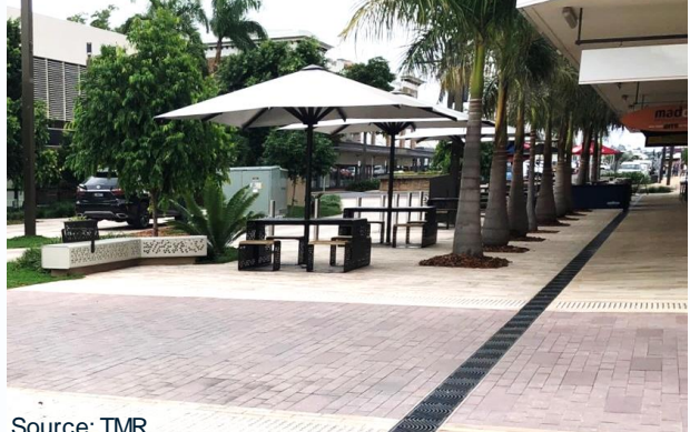
Integrated drainage and shade