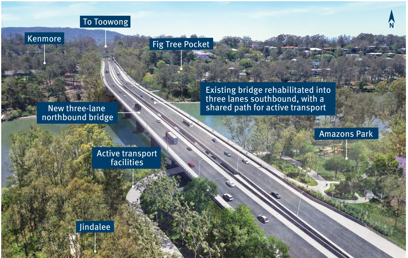
Artist's impression of Centenary Bridge.