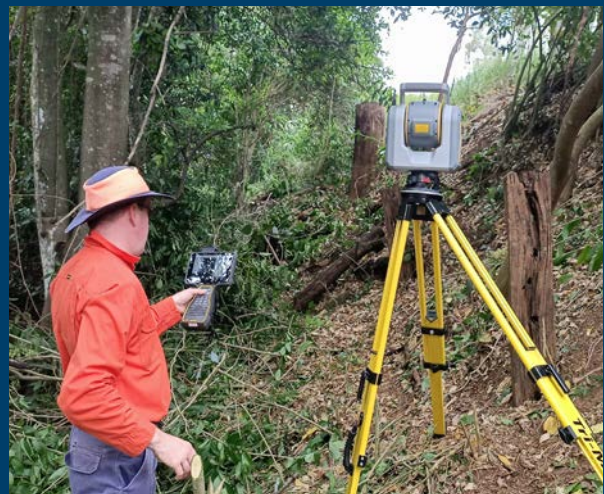
Specialists carefully locate, record and assess historical artifacts across the B2N project footprint and surrounding buffer zone.