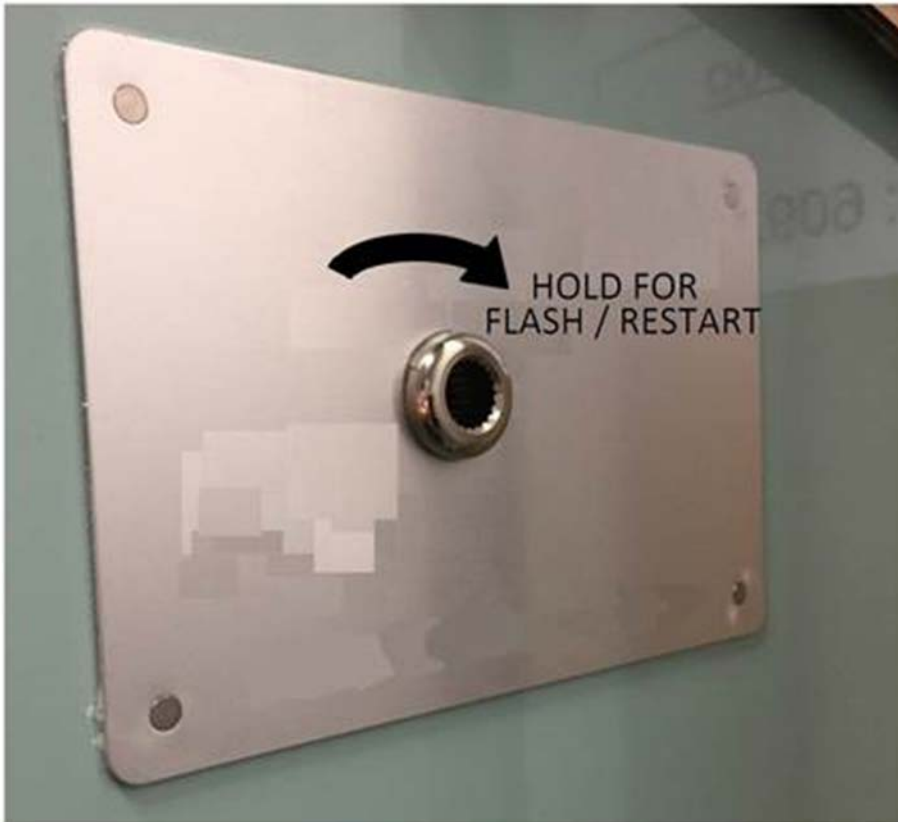
Figure B – Facility switch operational plate

The plate is mounted on the cabinet and positioned in such a manner that a hole in the cabinet side is covered until required.