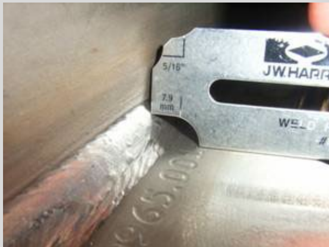
Figure 10.5.5.2(a) – Fillet weld leg length

The weld fillet gauge verifies the weld leg length is the correct size. Figure 10.5.5.2(a) shows the leg length on the vertical face is 8 mm (7.9 mm).