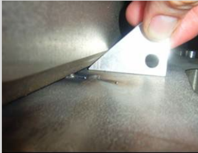
Figure 10.5.4(a) – Bevel angle on a butt weld preparation

The preparation of this type of joint is critical in guaranteeing the weld has its intended purpose. This may be due to the strength of the connection or to prevent crevice corrosion. Both the bevel angle (Figure 10.5.4(a)) and the root gap (Figure 10.5.4(b)) are important to getting the correct weld. The WPS should specify both factors.