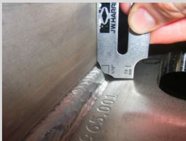
Figure 10.5.5.2(b) – Fillet weld throat thickness

The weld fillet gauge also verifies the weld throat thickness is the correct size. Figure 10.5.5.2(b) shows the throat thickness is compliant with the requirements of an 8 mm (7.9 mm) fillet weld.