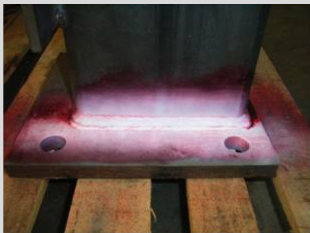
Figure 10.5.5.2(c) – Dye penetrant testing on a post

A potential defect with stainless steel is lack of fusion. The use of dye penetrant testing can identify areas which have lack of fusion.