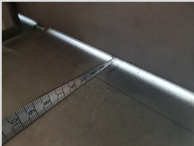
Figure 10.5.4(b) – Bevel angle on a butt weld preparation

This Hold Point may take place at several stages during the fabrication process.