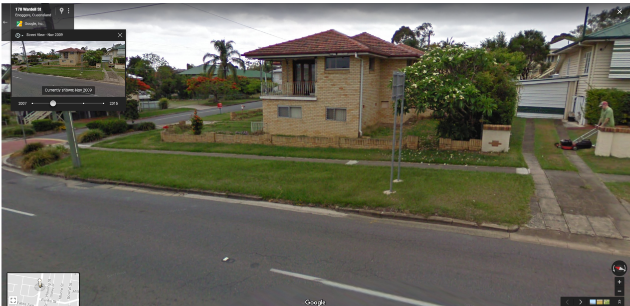
2009 - BEFORE the TMR new kerb is installed No existing outlet on to Wardell Street