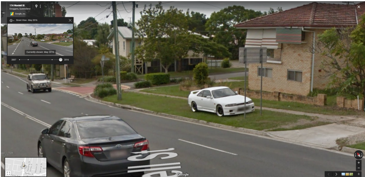
2016 - AFTER the TMR new kerb is installed